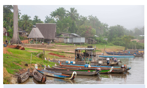
Village along the river

We must let them show us this ancestral knowledge and the youth of these communities must also understand the importance of keeping this knowledge. It is our collective responsibility. Each piece of knowledge is interesting and gives a point of view on the world to better understand the reality of ecosystems. This sharing between us, humans, and the others existing -plants, animals, forests...- must be that of balance. This is what the current crisis also reveals to us. The Amerindian populations can help us to avoid a predatory vision of nature.